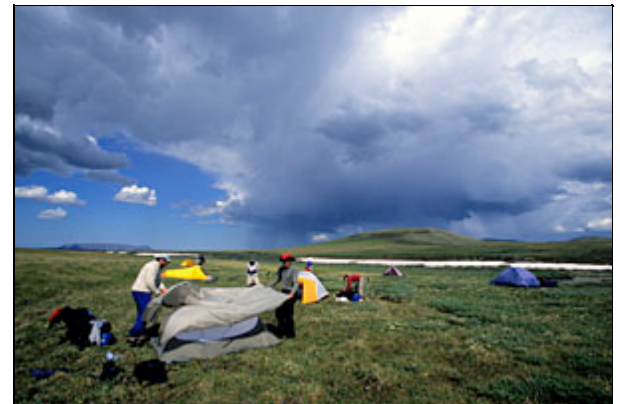
SANE ASYLUM: Camping at the Arctic National Wildlife Refuge.

You've heard it all before, but really, this could be your last chance to see the much debated 1002 area of the Arctic National Wildlife Refuge (ANWR) in its current state. Since the 1980s the 1002 area has been a battleground between oil lobbyists and environmental groups. Petroleum companies claim the oil in the 1002 area would help reduce U.S. dependence on foreign petroleum, while the environmental lobby maintains that any development would destroy one of the most pristine pieces of Arctic tundra left in the U.S. and the calving ground of the 130,000 strong Porcupine caribou herd. At the moment, legislation is in the works to begin drilling in 1002, and most pundits think the chances of it passing are good.